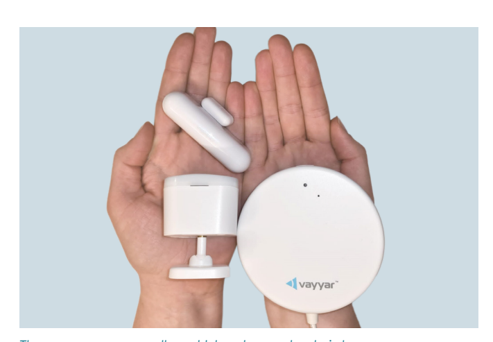
The sensors are small and blend seamlessly into the home.

It also supports daily life with a range of additional functions, such as medication, appointment, and drinking reminders, and by initiating conversations. All of this without any complicated controls – through Vivi, the voice assistant.